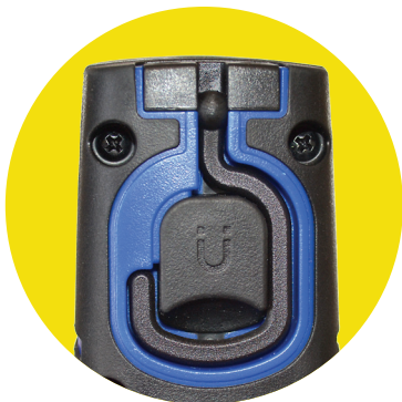
Flush finish dual hooks