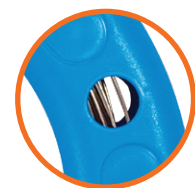
Windows to see the amount of draw-wire in the roll