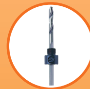
X2 Economy Arbors supplied with pilot drills