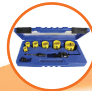
Comes with carry case