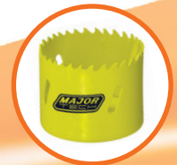
Set of Heavy duty bi-metal holesaws