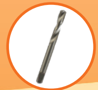
X2 High speed steel Pilot drills